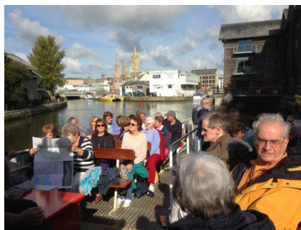
River Fal cruise

The group ready to come back from Tintagel.