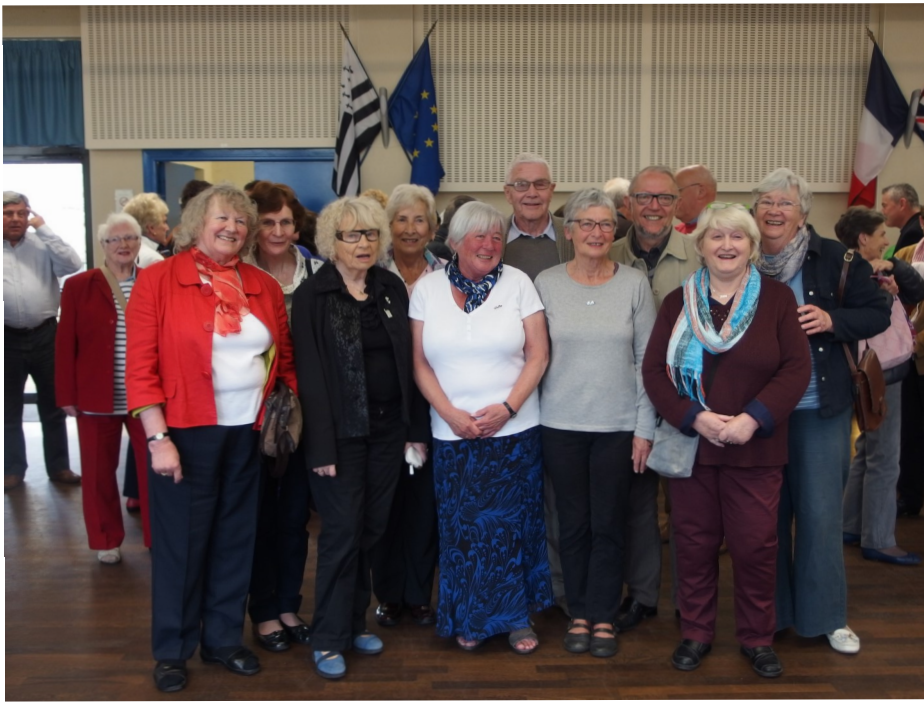
A rare photo of past and present Presidents and Chairs of Morlaix and Truro Twinning Associations

June saw us hosting the annual County Boules competition at our own Boscawen Park.