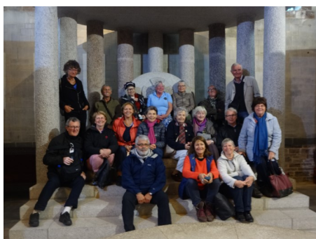
Our French friends at King Arthur's Hall, Tintagel