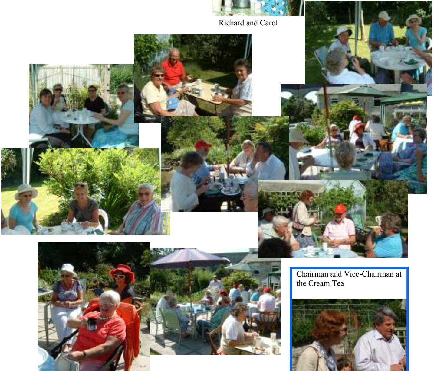
Chairman and Vice-Chairman at the Cream Tea