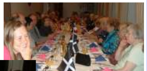
Enjoying the meal at Tregoninny

The weather helped, and Cornwall looked beautiful!