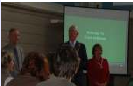
At the Civic Reception in the Town Hall

Everything went to plan after earlier and last-minute problems! The Civic Reception, the evening meal, the visits to Trevarno, the Cyder Farm and the Ice Cream factory were all enjoyed and appreciated .