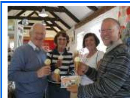
Enjoying locally made ice creams